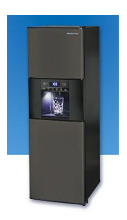
IMC Ice II Floor Model